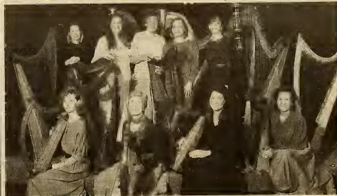
The Celebration of the Irish harp at McGonigal's Mucky Duck is part of KPFT's Real St. Patrick's Day Pub Crawl, Sunday, March 17, 1991.

All ticket proceeds will benefit KPFT 90.1 FM/Pacifica to help offset tornado damage and security additions at the transmitter site and also to offset security equipment installed at the radio station ($6,700).