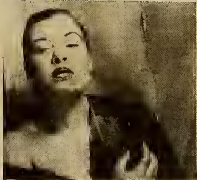
American blues singer Billie Holiday, known as "Lady Day", featured on "The Blue Ladies" 5-8 a.m., Friday, March 8.

Then come Billie Holiday and the bond singers of "Cofe Society". It's well known that Ms. Halldoy's life often reflected the dork lyrics she song. Modern day blues artists carry on the tradition: women who belt out the blues in that incredible marriage of pain and pleasure, infused with spirituolity. This is a program in their honor in celebration of International Women's Day.