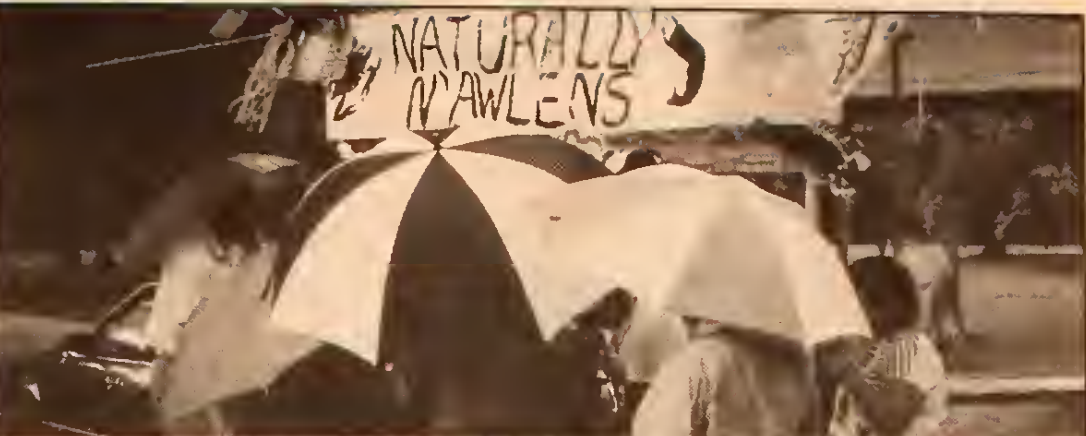
The gumbo tastes great, even in the rain at the First Place Prize Winners: Naturally N'awlens. Thanks to the 2,000 -3,000 intrepld Cajuns who decided to "laissez les bon temps rouler" anywayi