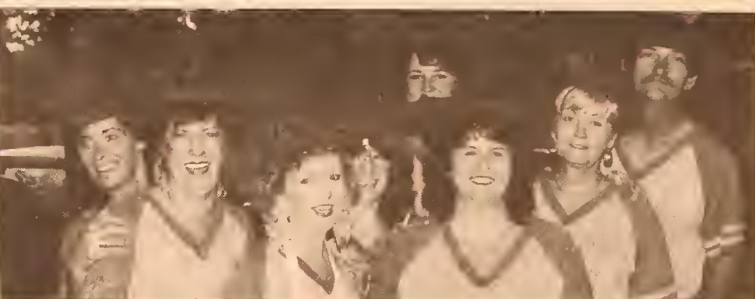
SHOWMANSHIP WINNERS: THE LONG ARMS BAY AREA CRIME STOPPERS