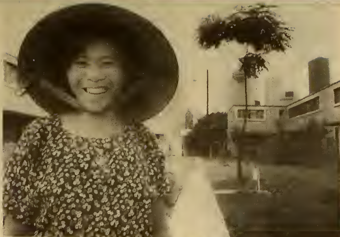
A resident of Allen Parkway Village does some gardening in the shadow of the Houston skyline.

Listen for "Freedman's Town Under Siege" during our Fall Fundraiser. Formulate your own opinion whether you want to help Houston's oldest black community stay established or that you agree to tear down a piece of history.